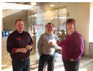
Candid photos from February MCPA Board meeting at Augsburg College.

"We are like tenant farmers chopping down the fence around our house for fuel when we should be using nature's inexhaustible sources of energy - sun, wind and tide. ... I'd put my money on the sun and solar energy. What a source of power! I hope we don't have to wait until oil and coal run out before we tackle that." -- Thomas Edison to Henry Ford and Harvey Firestone (1931)