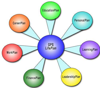
Century College GPS LifePlan Innovations in Student Development Award